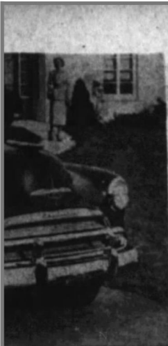
edan, one of 14 new Chevys. Design improvements in raised rear fender crowns, and driving comfort are also make their debut in dealers'